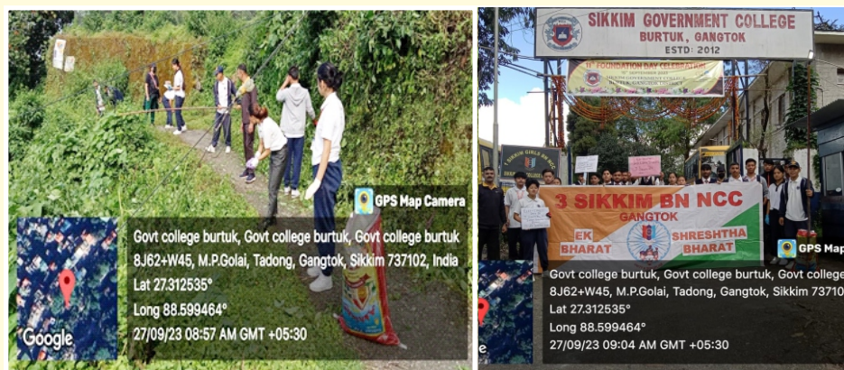
FIG. 4. CLEANLINESS DRIVE UNDER EK BHARAT SHRESTHA BHARAT (EBSB) AT SIKKIM GOVERNMENT COLLEGE, BURTUK, SEPTEMBER 2023.