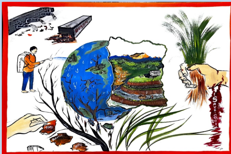
Art by Sonam Bhutia |Roll No. 21BA0039