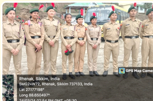
FIG. 14 ANNUAL TRAINING CAMP (ATC) MARCH 2024, RHENOK, SIKKIM