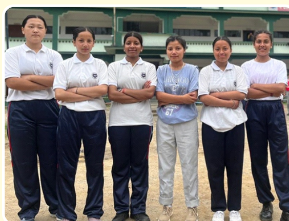
FIG. 18 AND 19 THAL SAINIK CAMP (SELECTION CAMP) KAMRANG, NAMCHI, JUNE 2024.