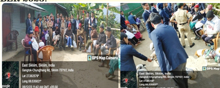
FIG. 11 and FIG. 12: OLD-AGE HOME VISIT, TINTEK UNDER SOCIAL SERVICES AND COMMUNITY DEVELOPMENT (SSCD) .