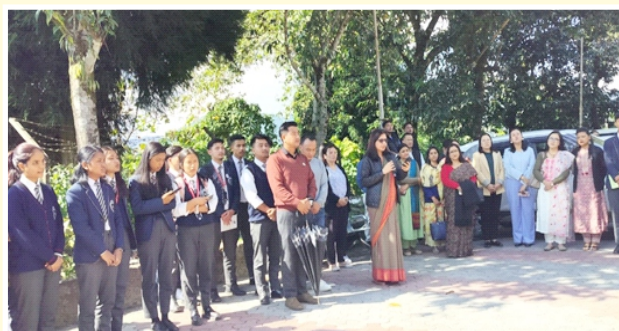
FIG. 8 NATIONAL UNITY DAY, 31 ST OCTOBER 2023.