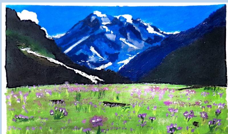
The Yumthang Valley