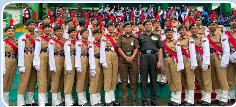
FIG. 1. INDEPENDENCE DAY PARADE AUGUST 2023