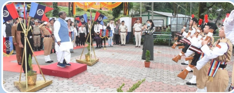
FIG. 2. GUARD OF HONOR PRESENTED TO HIS EXCELLENCY GOVERNOR OF SIKKIM SEPTEMBER 2023.