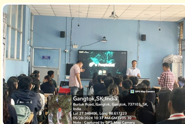
FIG. 17 PROGRAMME ON 'MENTAL HEALTH, MAY 2024.