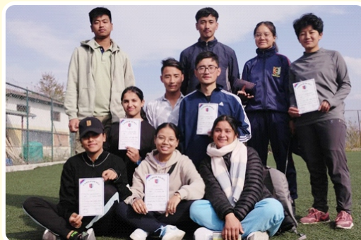
FIG. 10 CADETS AT ATC CAMP, PAKYONG, DECEMBER 2023