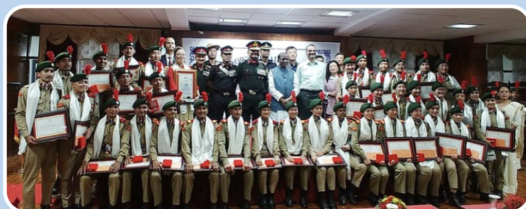
FIG. 3 GOVERNOR'S MEDAL AWARDED TO 05 CADETS OF 3 SIKKIM BN NCC. SEPTEMBER